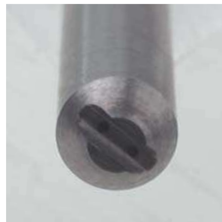
Shank end suitable for minimal quantity lubrication without consolidation or dead pockets of coolant.

minimal lubrication applications: It prevents neat oil from consolidating and offers simple handling characteristics and cost-effective production. In combination with Guhring hydraulic expansion chucks and Guhring's MQL coolant delivery set, it offers an optimal and cost-effective solution for MQL machining with highest bore hole quality and outstanding lifetime.