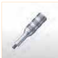
Spare parts page 108