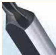
Shank with clamping flange 7502-...

Ordering example: 1 piece H 7502-0801 0290 R = Ordering number: 20030 4,000