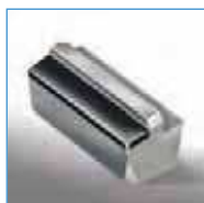
Insert PCD-tipped W 3570-.... .... L